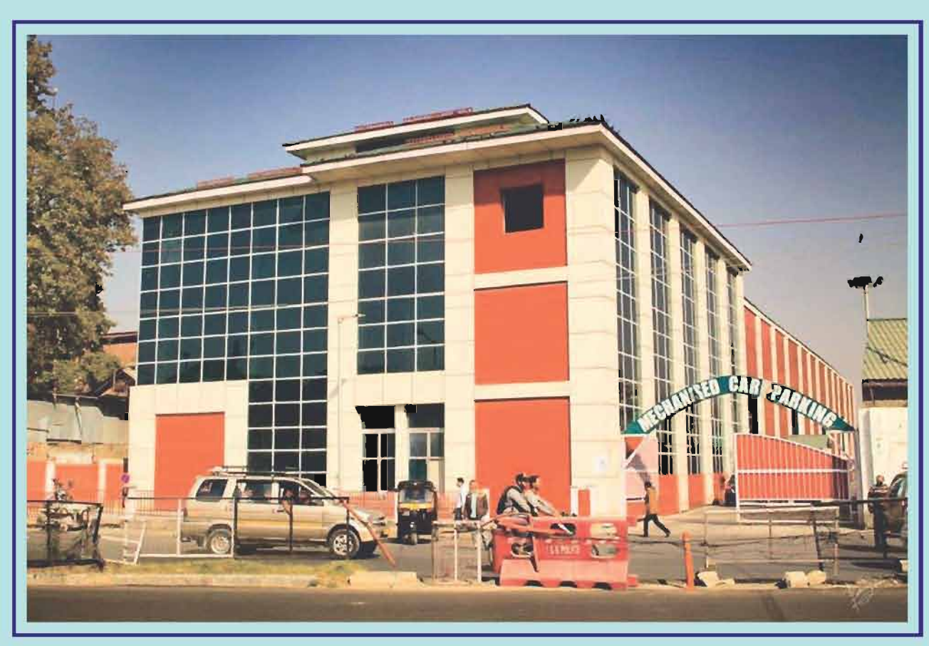
MECHANISED CAR PARKING, Srinagar